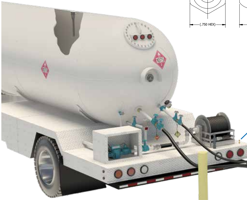
GROUNDING LUG 7171 SERIES